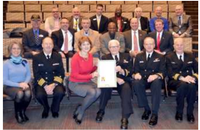
County Commissioners and Navy League members at El Paso County Pearl Harbor Day proclamation event