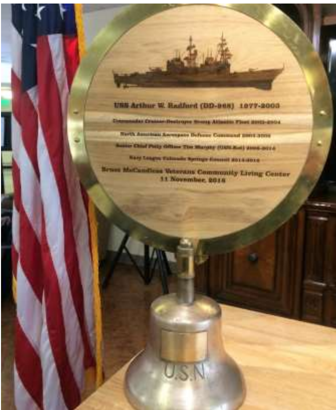
USS Arthur W. Radford (DD-968) quarterdeck bell